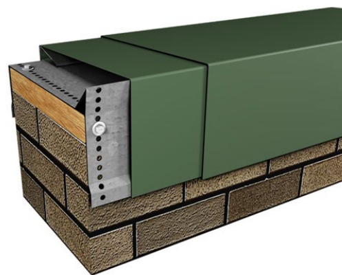
Perma Tite Coping Gold (Tapered Version)

Product details stated are nominal as manufactured, and the results of tests and/or calculations and therefore are non-binding and do not represent a guarantee or warranted characteristics. User and/or designer are responsible for confirming suitable performance for specific application and conforming with all applicable laws and regulations