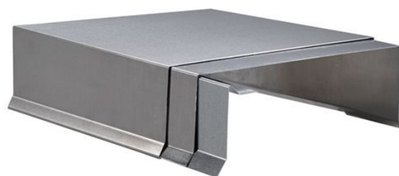
One Edge Coping (Tapered Version)

Product details stated are nominal as manufactured, and the results of tests and/or calculations and therefore are non-binding and do not represent a guarantee or warranted characteristics. User and/or designer are responsible for confirming suitable performance for specific application and conforming with all applicable laws and regulations